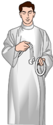
Grab knotted end with your right hand