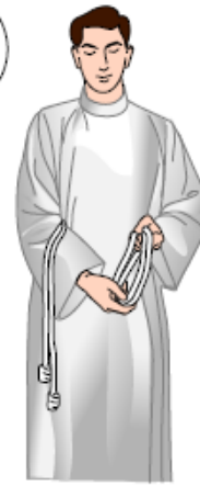
Using right hand, slip loop over left hand, keeping hold of cincture