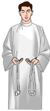
Wrap around waist with knots on your right side