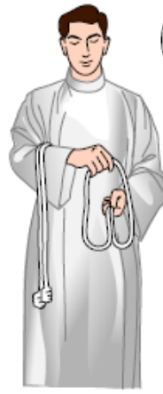
Grab end of loop made by the fold and overlap as shown