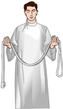
Fold cincture in half