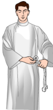
Drop loop and then tighten around waist