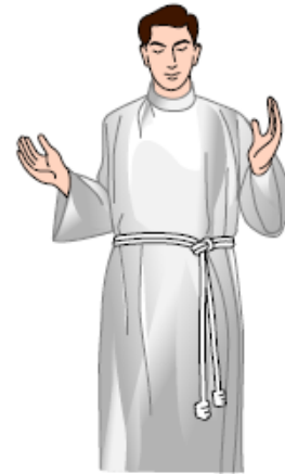
Knot is on left hip